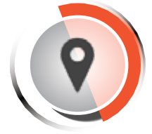
Top Level Location