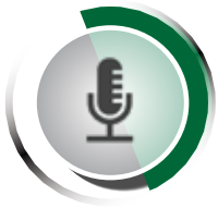
IVR and Call Reporting