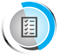
Call Reporting and Billing Reports