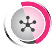
Scalable and Customisable

Our VPBX means that your calls divert to our data centres. We use our secure technology to re-route the call and direct it appropriately. This solution can provide you with a range of features not available on a traditional PBX. It is software based, therefore installation is relatively quick and easy. It works with most VoIP and SIP compliant IP phones or analogue phones.