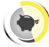
Reduce Capex Spend