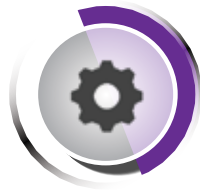
Simple and Fast Setup